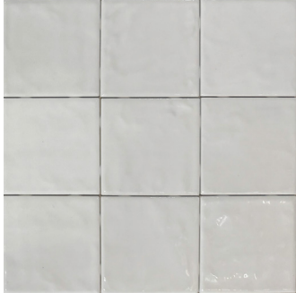
10x10cm | 4"x4" BR ( GLOSSY )