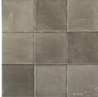
10x10cm | 4"x4" BR ( GLOSSY )