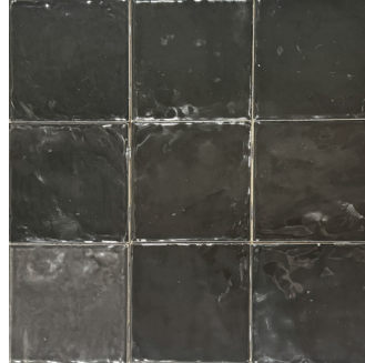
10x10cm | 4"x4" BR ( GLOSSY )