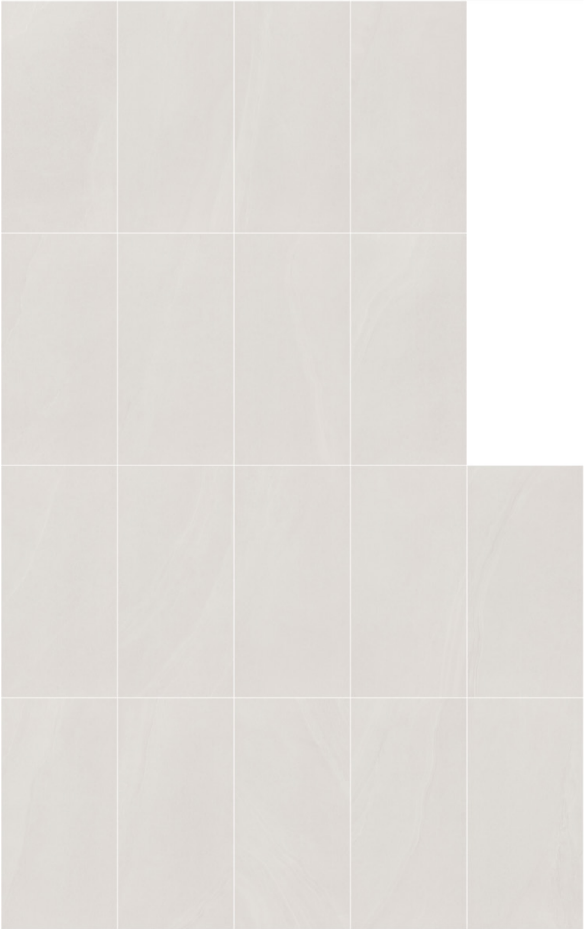
KHALI OFF-WHITE 24X48FACES