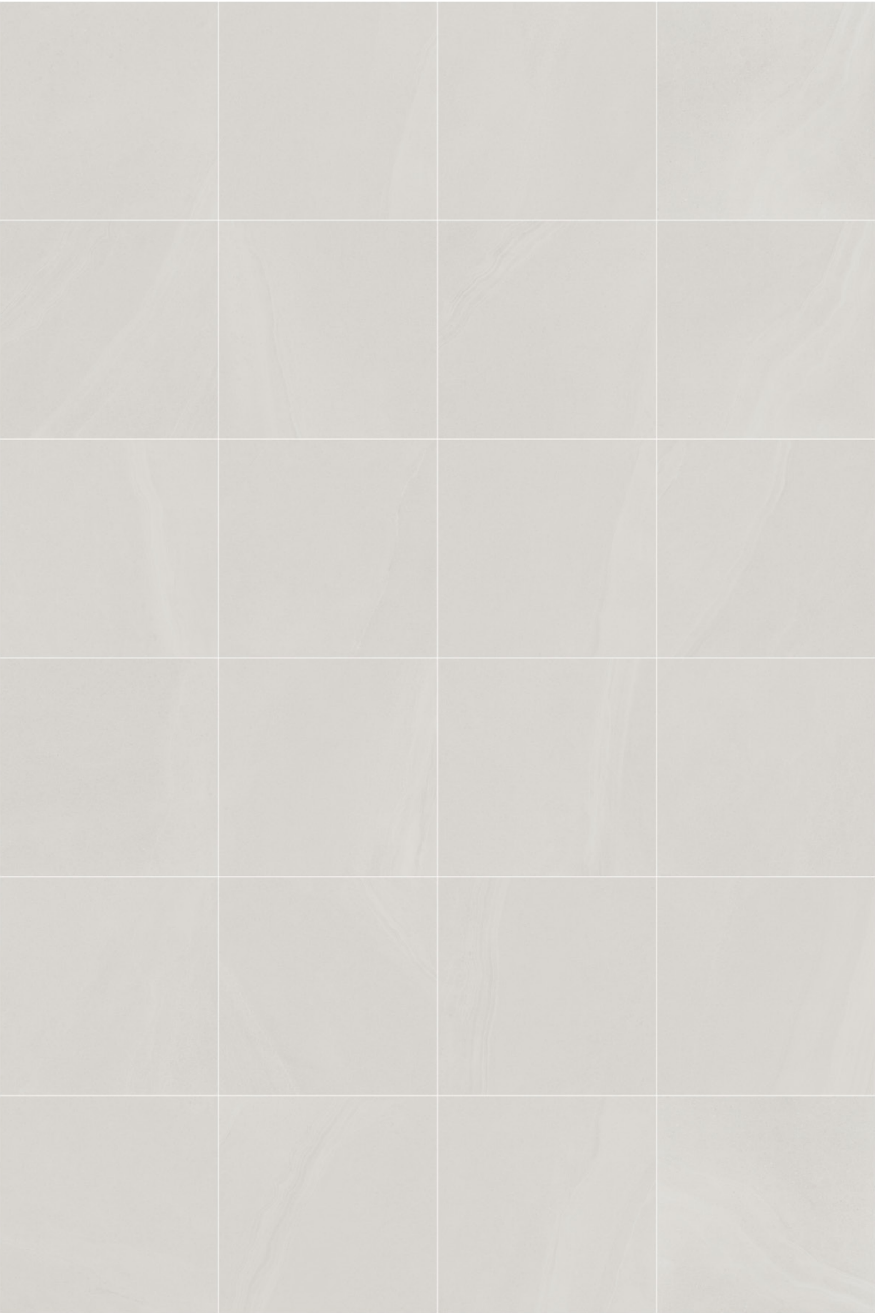
KHALI OFF-WHITE 24x24 FACES