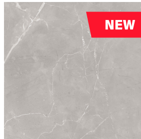
30x30 cm | 12"x12" AC (SATIN) DCOF ≥ 0.42