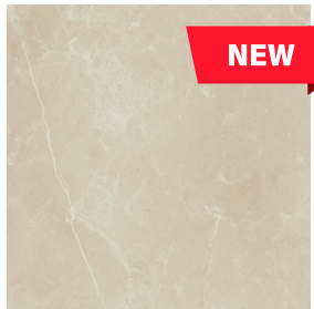
30x30 cm | 12"x12" AC (SATIN) DCOF ≥ 0.42