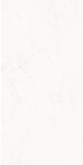
30x60 cm | 12"x24" AC (SATIN)