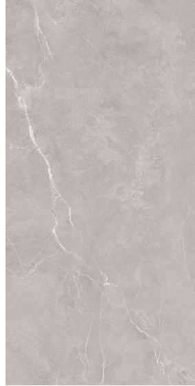
30x60 cm | 12"x24" AC (SATIN)