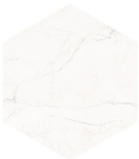
20x23 cm | 8"x9" AC (SATIN)