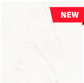
30x30 cm | 12"x12" AC (SATIN) DCOF ≥ 0.42