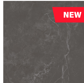
30x30 cm | 12"x12" AC (SATIN) DCOF ≥ 0.42