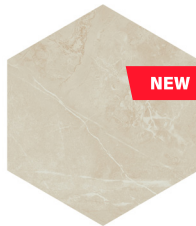
20x23 cm | 8"x9" AC (SATIN)