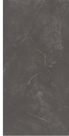
30x60 cm | 12"x24" AC (SATIN)