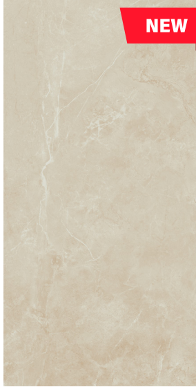
30x60 cm | 12"x24" AC (SATIN)