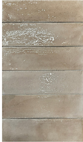
5 x 20 cm | 2" x 8" BR ( GLOSSY )