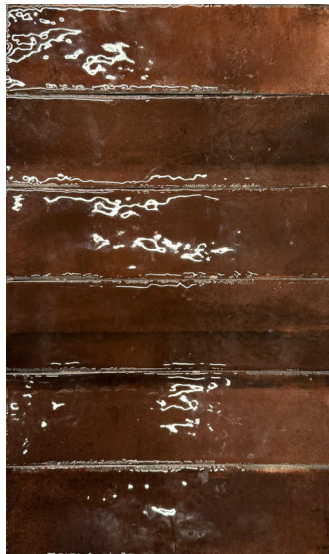
5 x 20 cm | 2" x 8" BR ( GLOSSY )