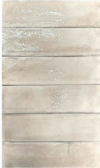
5 x 20 cm | 2" x 8" BR ( GLOSSY )