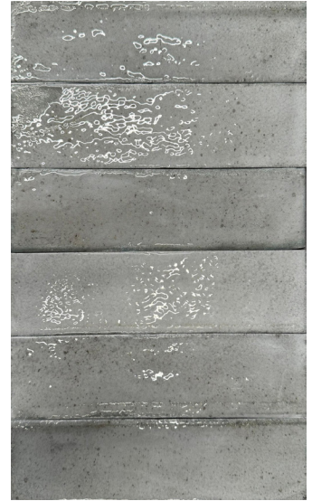
5 x 20 cm | 2" x 8" BR ( GLOSSY )