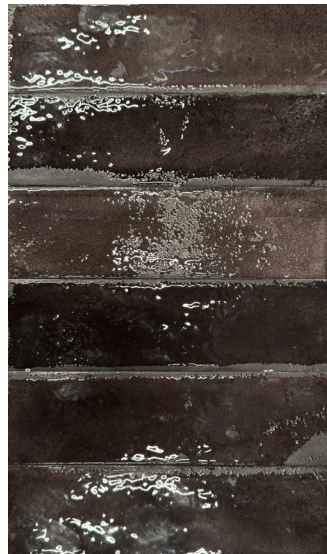
5 x 20 cm | 2" x 8" BR ( GLOSSY )