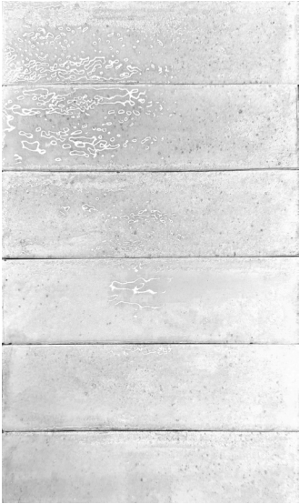
5 x 20 cm | 2" x 8" BR ( GLOSSY )